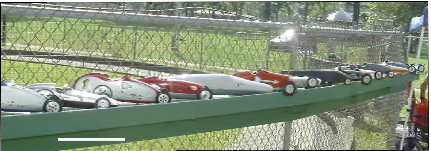
Some of the cars ready to run at Anderson.