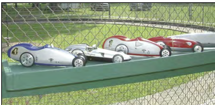
Some of Ron Hesskamp's stable of cars.