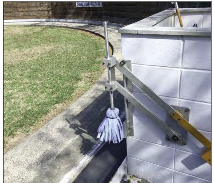
The shut-off broom has been updated and works beautifully.