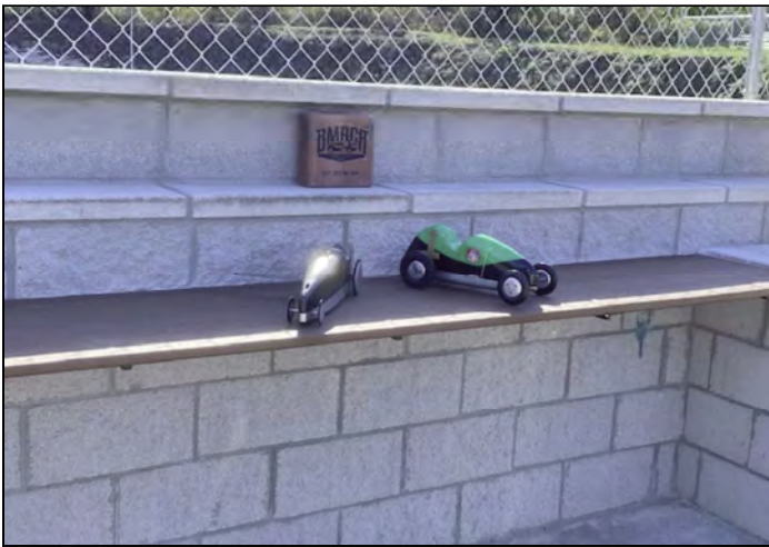
The staging table where donation acknowledgement bricks will be located.

A raffle will be held so please bring any item you want to donate to the raffle, and of course bring plenty of items to swap and sell.