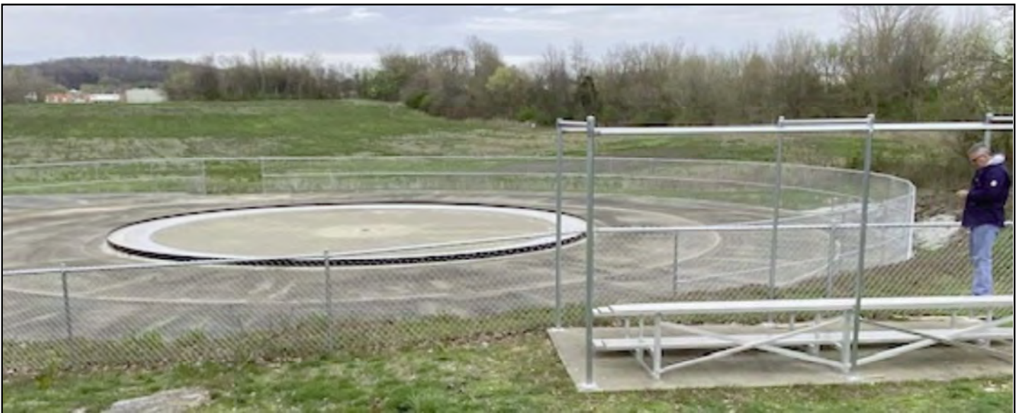
The new Bluegrass track as viewed from the bleachers.