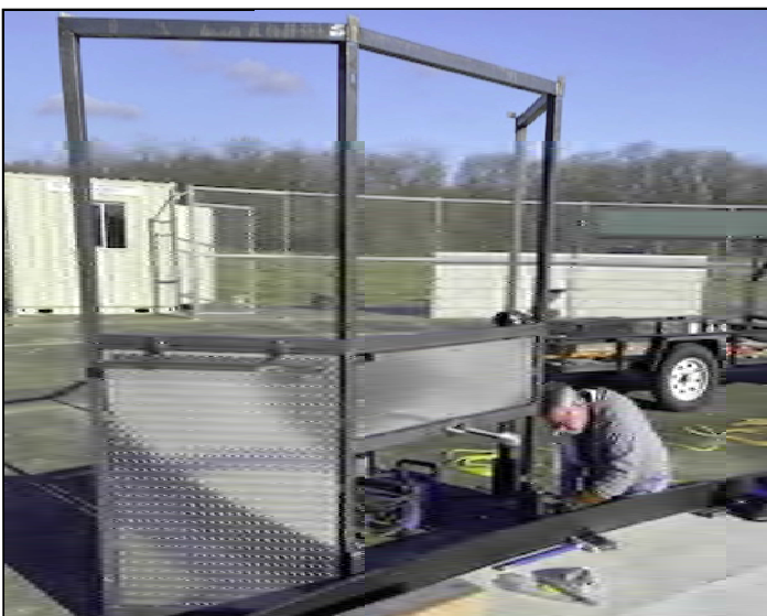
The "Drivers'" safety barrier is adjacent to the guard rail around the track running surface.