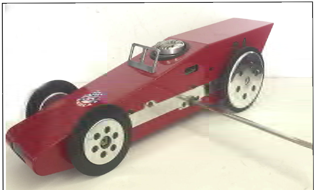
(Right) Charlie Hamill's custom built Class 10A Jett .46 powered car.