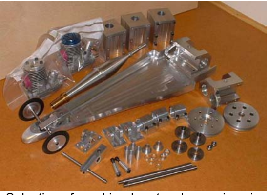
Selection of machined parts, also engines in their protective plastic bags. Picture taken on 11 March 2003.