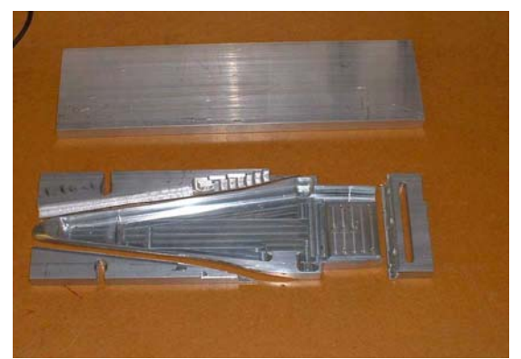
The fully machined lower pan, showing waste material and an unmachined blank. Total machining time approx. 30hrs.