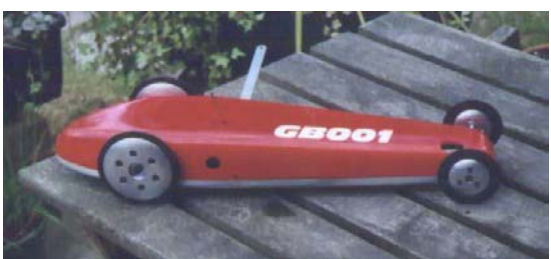
Side view of the car in its original form soon after completion.

the class. Originally developed for 2,5cc speed flying, it has a very small volume but seems well suited to the NovaRossi engine.