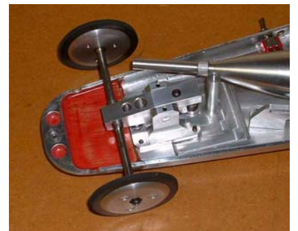
View of the front suspension with adjustable damping.