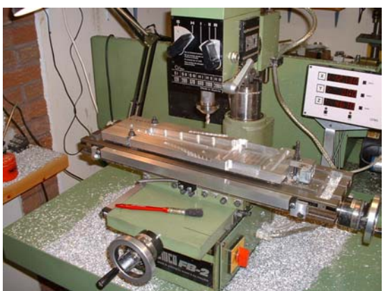
The lower pan, part way through the machining operation. 3 axis digital readout proved invaluable during this and other operations. An invaluable piece of equipment!

estimate that the project took about 300 hours, but I machined more than one of most items, thus giving some stock parts should I wish to build another car, or to have replacements for parts damaged in competition.