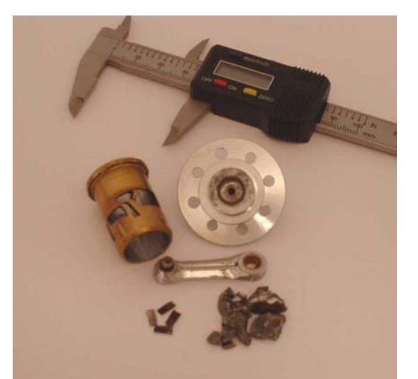
The internals of the motor – the pile to the right is the piston, the four small parts to the left are parts of the gudgeon pin. Damage to liner and cylinder head apparent in this view.