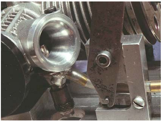
A nicely machined venturi using a needle valve assembly from a 3,5cc CMB marine engine. Detail from an early car by Mart Sepp.

work on the inside of the engine should be left at lightly taking off any sharp edges around the port apertures, cleaning and careful reassembly.