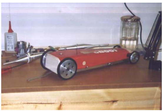
The car after surgery to the back end and prior to re-finishing with glass & epoxy.

diameter of the pin retaining the gear was too large ( \emptyset 2,5mm through the \emptyset 8,0mm axle). Another lesson learned. A new axle was made and the gear retained using a \emptyset 1,6mm piano wire pin.